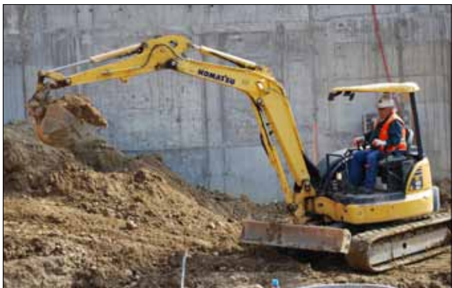
Construction crews are working to improve sewage treatment plants across the Chesapeake Bay region.