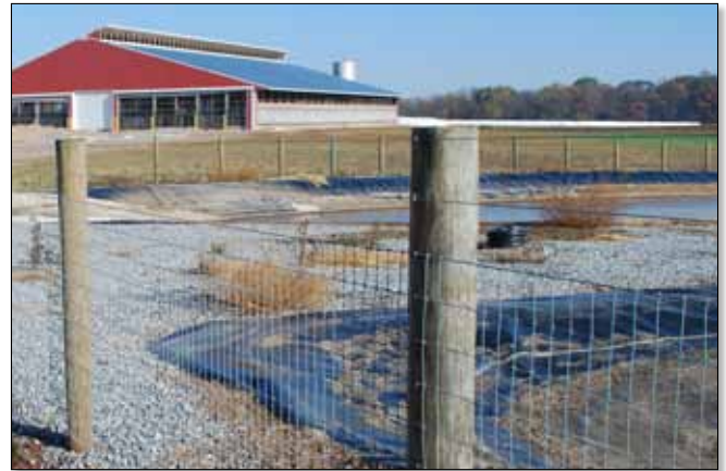
Dairy farmer Leroy Walker built these two manure pits and this new barn to reduce runoff pollution into a nearby stream, which flows toward the Chesapeake Bay.

Walker's construction project included a pair of plastic-lined manure storage pits, a shed to keep rain off his feedlot, and an expanded, state-of-the-art barn with good ventilation and drainage.