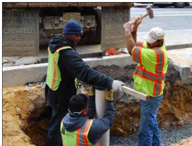
Workers build a stormwater pollution control device called a “bumpout” in Montgomery County, Maryland.

The workers are building a stormwater pollution-control device called a “bump out.” It’s a new technique—a grassy area built by the side of the road, with openings at either end to catch and filter rainwater as it flows down the gutter.